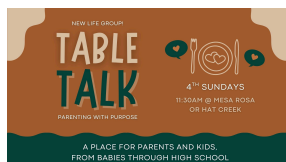
Table Talk - Life Group Sept. 28 after Sunday School

Let's make this Pumpkin Patch our best season yet!