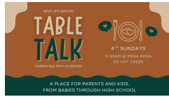
Table Talk - Life Group Oct. 26 after Sunday School

A life group for parents of kids of all ages to connect, share a meal, and find encouragement for the joys and challenges of raising the next generation. Join us the 4th Sunday of each month after Sunday school.